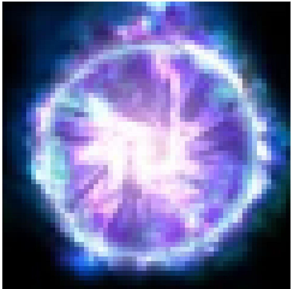
QA test 14 1 éve All test