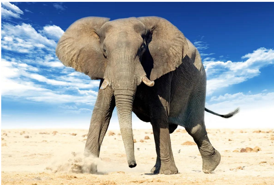
An angry elephant.

Elephants are well-known for living in matriarchal (female-led) social groups, and although elephants are respected and revered by people throughout their ranges in Africa and South Asia, they are also feared because they can be aggressive and dangerous