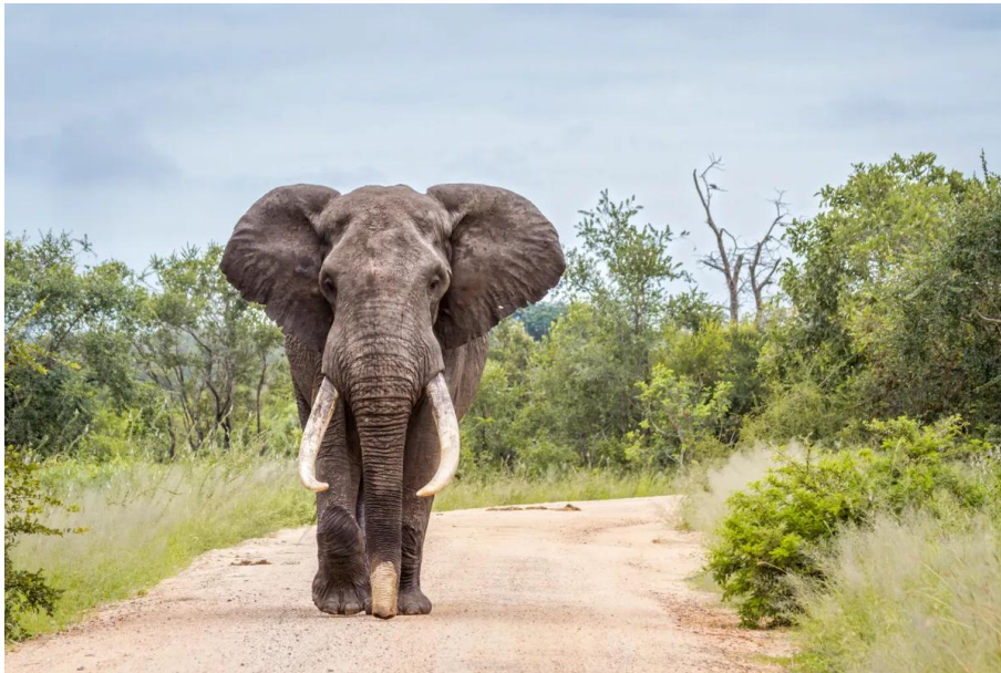
A bull African elephant with large tusks.

as a weapon in battles with rivals; and as a courtship aid – the larger his tusks, the more attractive a male elephant may appear to a female