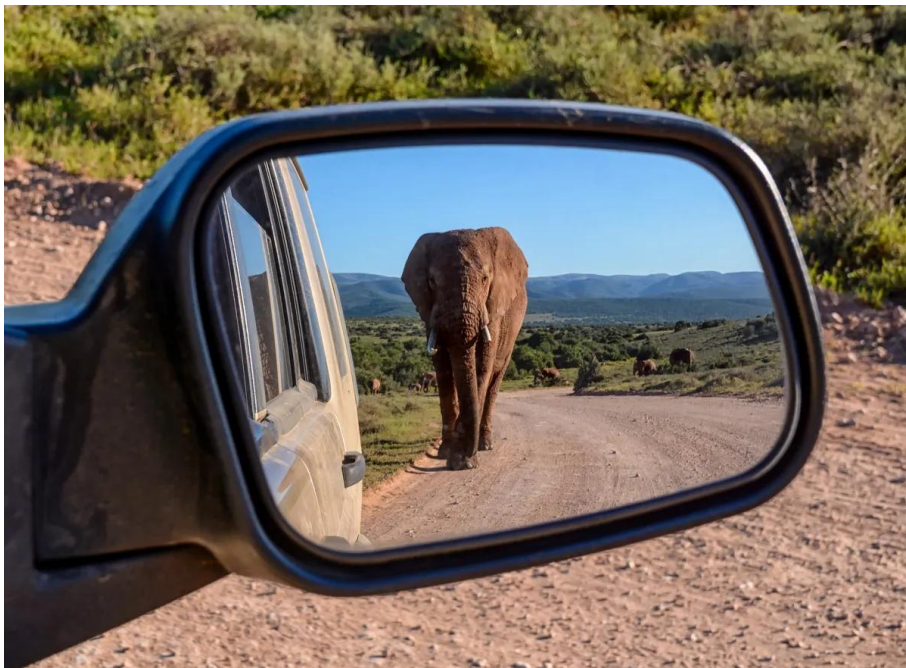
Elephants can recognise themselves in a mirror, although they probably need to be a bit closer than this...

Elephants can recognise themselves in mirrors. Scientists believe this is a sign of greater self-awareness. In one study, an Asian elephant called Happy repeatedly touched an 'X' painted on her forehead while looking in the mirror, an indication that she knew she was looking at her own reflection. Most animals will assume that a reflection is .another animal, and look for it behind the mirror