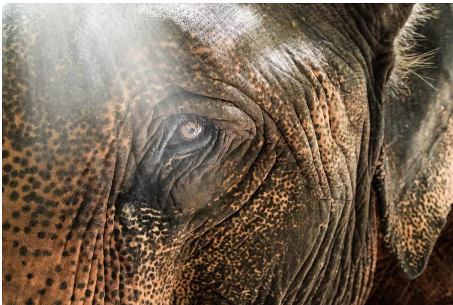
Elephants are some of the most intelligent animals in the world.

Elephants are the world's largest land mammals – and, aside from the great apes (humans, gorillas , chimpanzees, bonobos and orangutans ) – the most intelligent