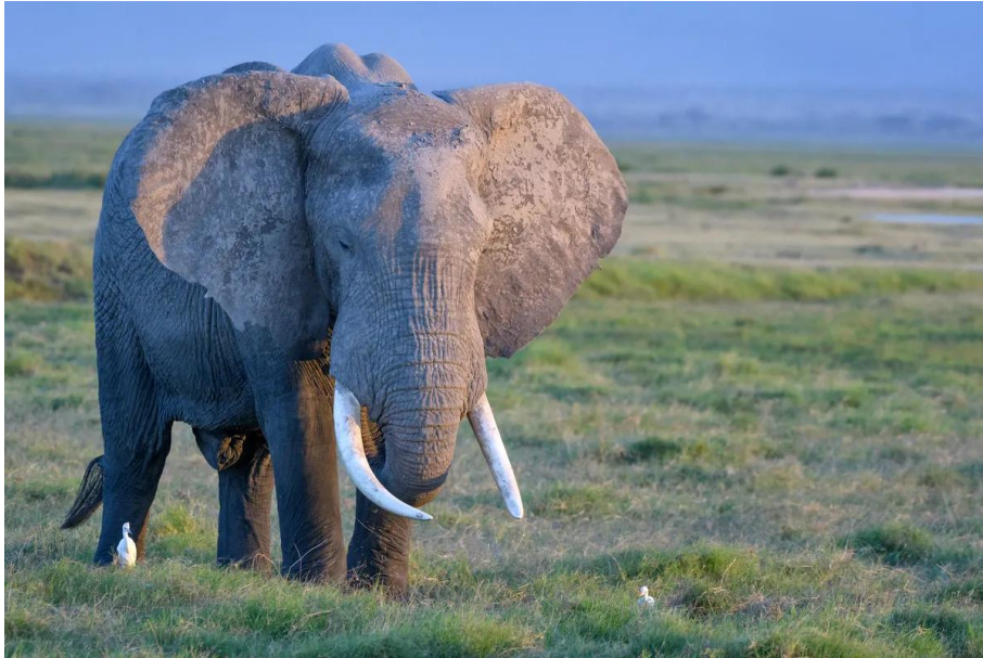
This African bull elephant might weigh six tonnes!