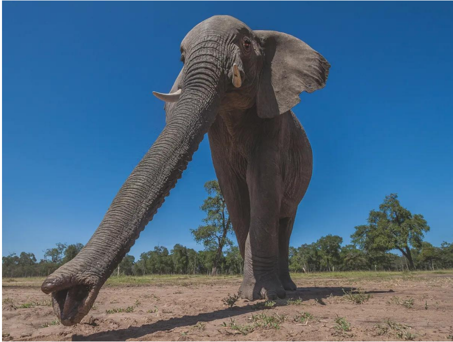
An elephant's trunk contains more than 40,000 muscles.

An elephant's trunk has many uses, from smelling, breathing, trumpeting, drinking and storing water to grasping food, greeting other elephants, displaying aggression and spraying dirt. It is one of the most versatile organs in the animal kingdom, able to pick up a pin or pull down a tree