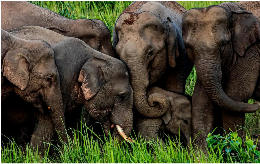
A family of Asian elephants in Khao Yai National Park, Thailand.