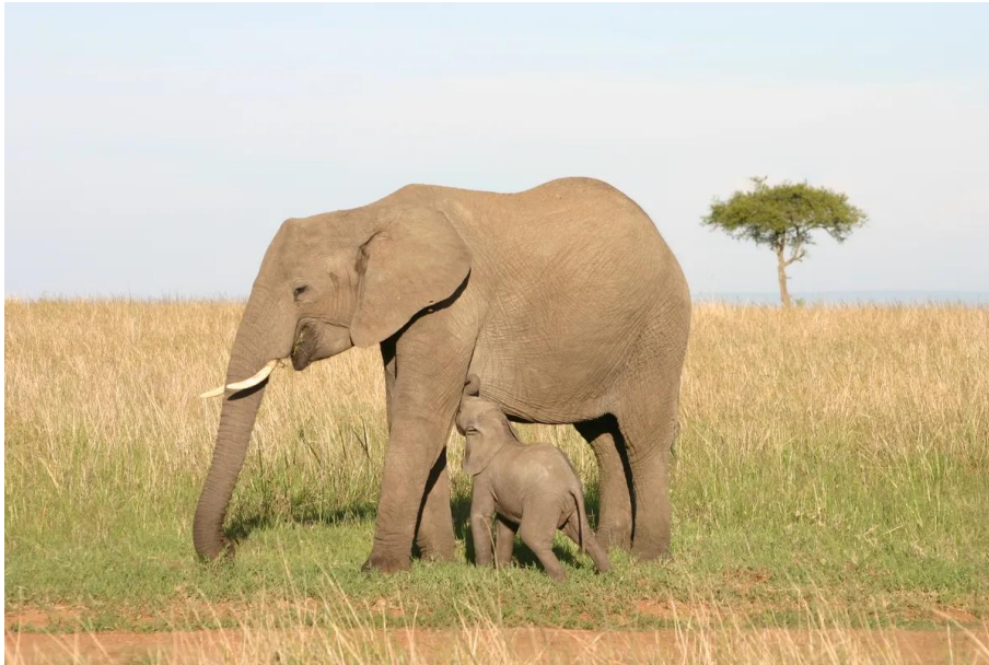
Baby elephants are nursed on milk produced by their mothers, just like all other mammals.

(the hairs are just small and sparse, so they don't look furry). .That means they fulfil all the requirements to be mammals