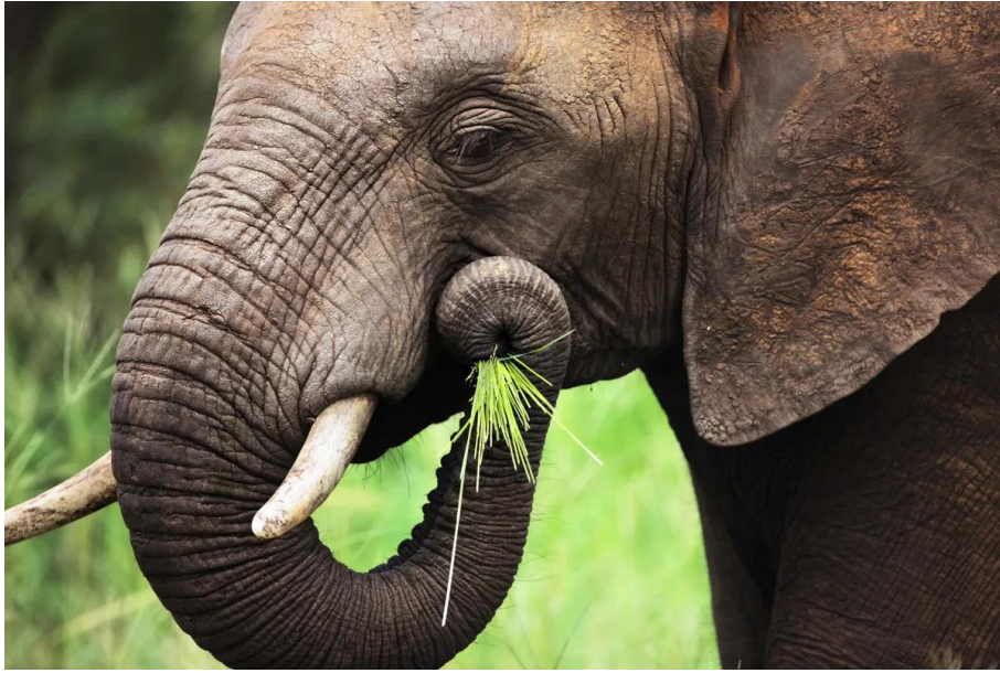
Elephants are vegetarians who love a good mouthful of grass.