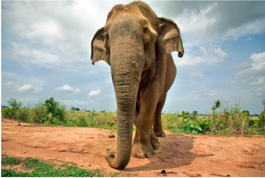
Wild Asian elephant in Sri Lanka.