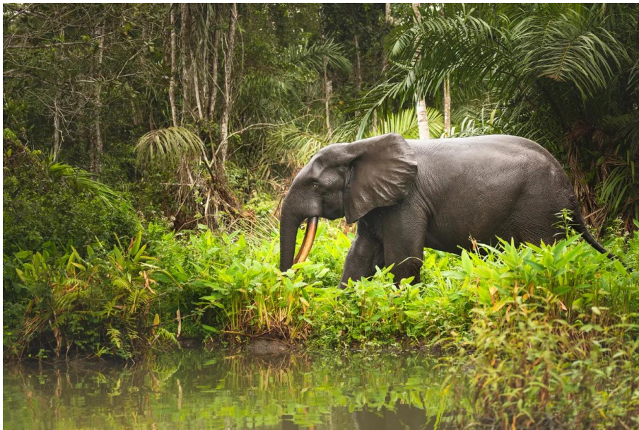
African forest elephant in Loango National Park, Gabon.

While the African elephants are closely related, the Asian elephant is quite distinct. The Asian elephant and African savannah elephant are endangered and the African forest elephant ( Loxodonta cyclotis ) is critically endangered: all three species are threatened by loss of habitat and poaching .for ivory