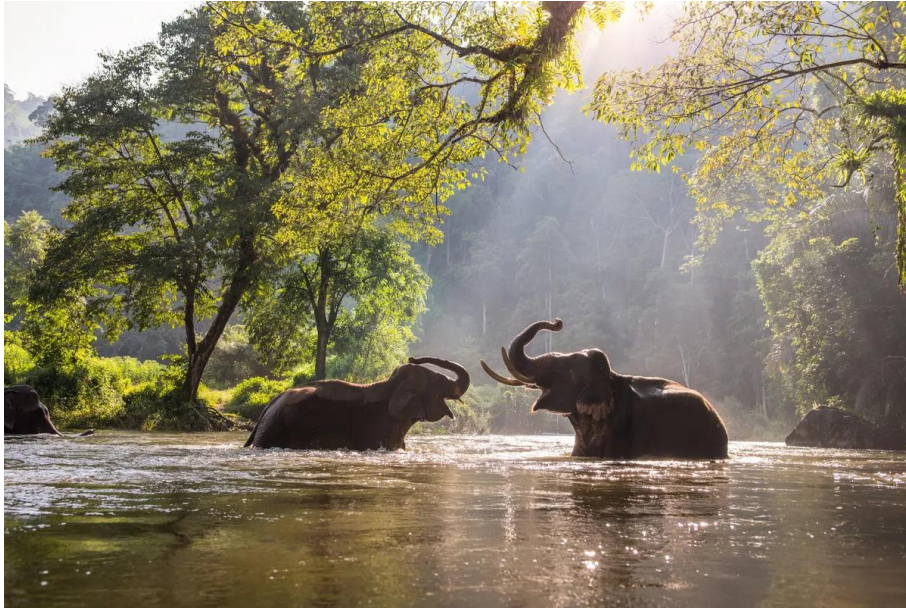
Asian elephants playing in a river.