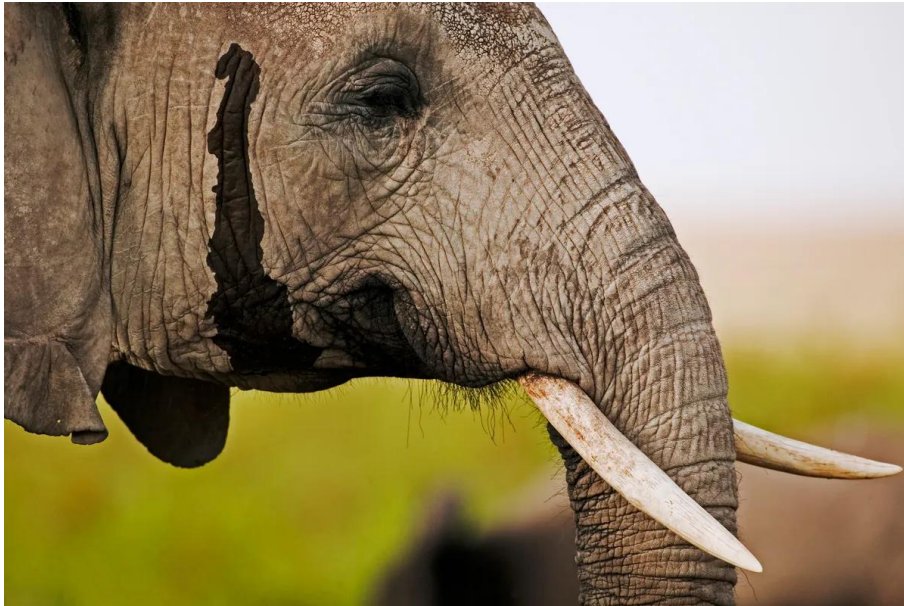
A male African elephant with secretion from its temporal gland associated with musth, in Amboseli National Park Kenya.

changes prepare them for competing for females and make .them much more aggressive