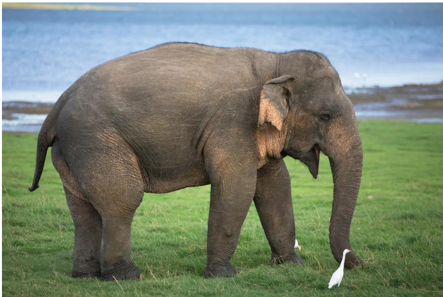
Asian elephant.

In general, African elephants are larger. Adult males weigh up to six tonnes, while male Asian elephants usually weigh no . more than five tonnes