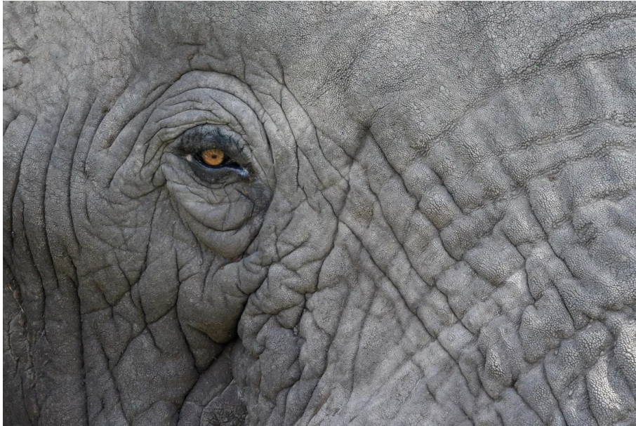
Elephants are wrinkly no matter how old they are!