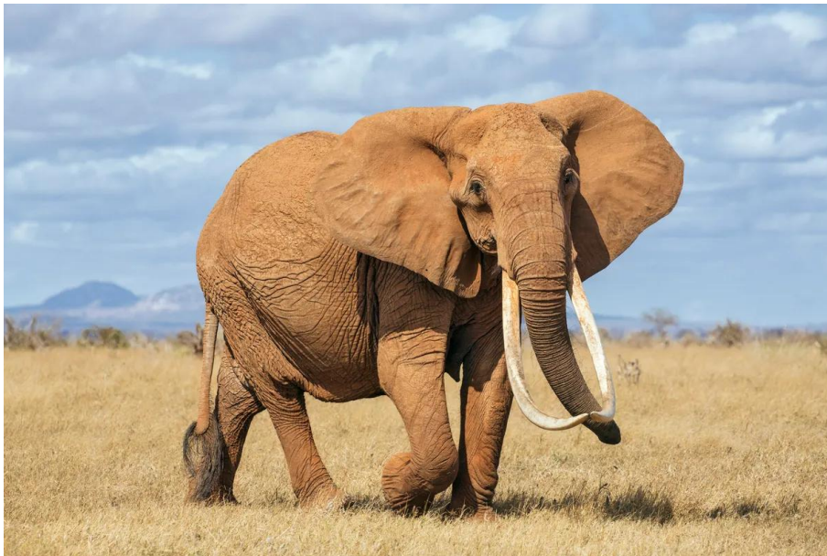
A female African elephant with impressive tusks in Tsavo East National Park.

Male and female African elephants naturally have tusks, but only male Asian elephants grow them. However, this is changing, and an increasing number of African elephants are being born without tusks. Those that do still have tusks have much smaller tusks than in the past - the average size has .halved in the last century