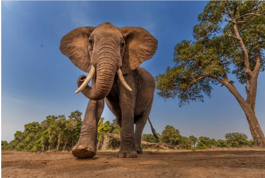
African savannah elephant (Loxodonta africana).

The tip of an African elephant's trunk has two fingers or . 'lips'; the Asian elephant's trunk only has one