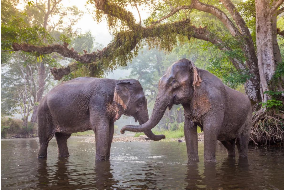
Elephants are very social creatures.

Elephants may be able to detect a thunderstorm from 280km away, and will head towards it, looking for water. In 2004, elephants appeared to head for higher ground before the .Asian tsunami struck